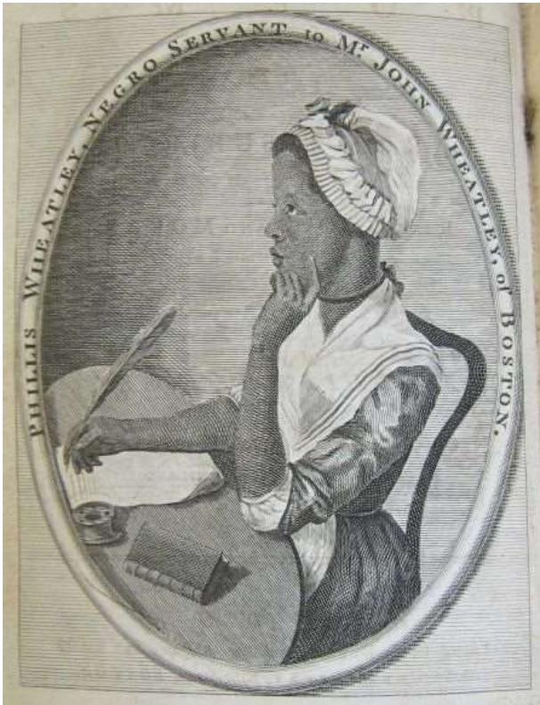
Images from Poems on Various Subjects, Religious and Moral, by Phillis Wheatley (1773)

As we celebrate Black History Month, we look at Phillis Wheatley - the earliest African-American woman poet to be published - and one of her key patrons: the Countess of Huntingdon.