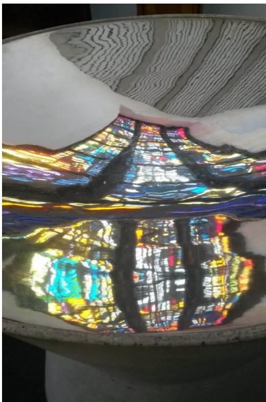
Stained glass at Lumen, the church next door, which was also damaged by the blast.