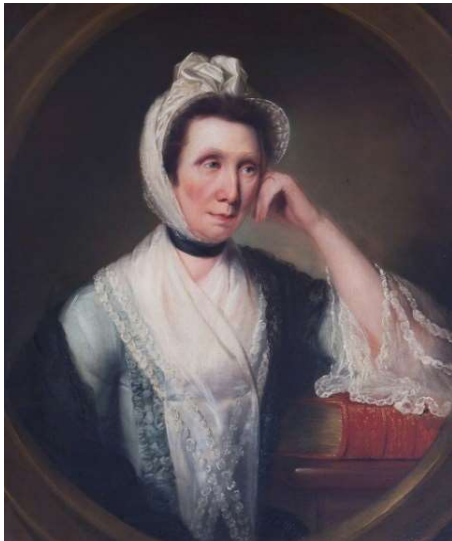
The Countess of Huntingdon (1707-1791) by John Russell (1745-1806)