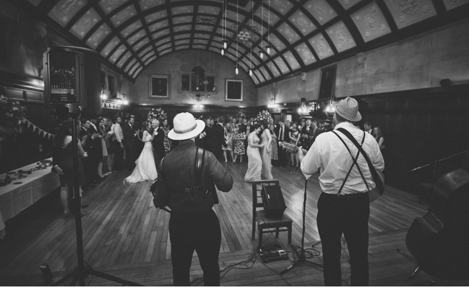
Celebrate in style with your favourite live band, DJ, or other entertainment. Soul & Motown bands, Pop & Rock bands, Brass bands, Jazz ensembles - the options are endless!

Carriages are at midnight, so you can dance the night away.