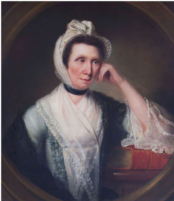
Selina Hastings, Countess of Huntingdon, by John Russell

But before this, in the 1730s, the Countess played an important role in a different sphere: in the establishment of the UK's oldest charity dedicated to the wellbeing and support of children.