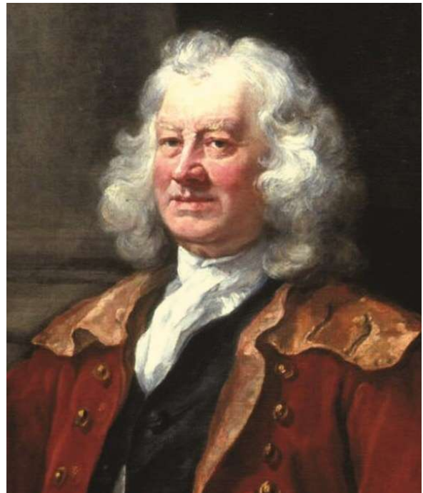
Thomas Coram, by William Hogarth

It began when Thomas Coram (1668-1751), a wealthy sea captain and trader, returned to London from America in the 1720s, and was shocked by the number of destitute children or 'foundlings' abandoned on the streets. The shame associated with having a baby outside marriage in the eighteenth century was enormous, and many women felt forced by family and prevailing moral opinion to abandon their children. Others were so poor that they were unable to look after a new baby. Coram wanted to provide a home for these children, and to give them a place where they could be looked after, educated, and trained for employment: so he decided to build The Foundling Hospital, which continues as the children's charity Coram to this day. 2