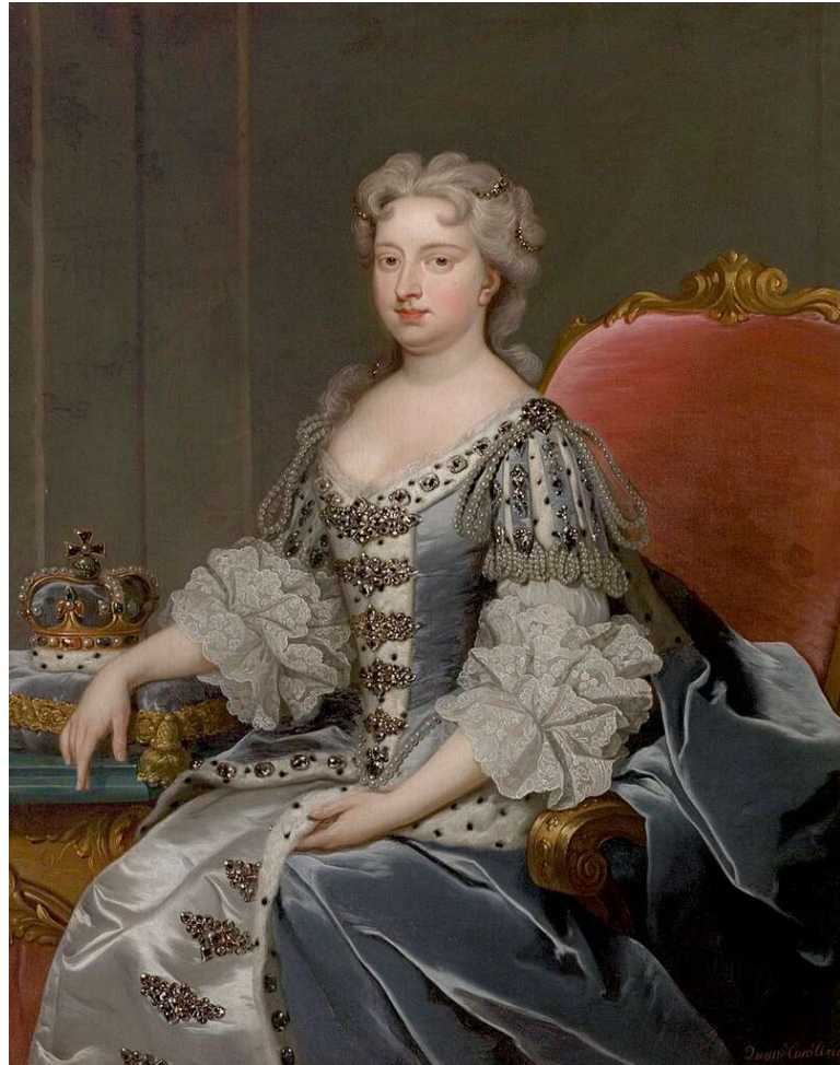
Caroline of Brandenburg-Ansbach, in the style of Michael Dahl (1656-1743), reproduced with permission of Warwickshire County Council

Although the Queen did not sign Coram’s Ladies’ Petition, every single one of the 21 women who did so was one of Queen Caroline’s Ladies of the Bedchamber. 10 Caroline, like the Countess of Huntingdon, was a devoted mother, and had eight surviving children; and she herself had been orphaned aged 13. 11 Coram’s website further points out that “We know Caroline was interested in the Foundling Hospital because she commissioned a pamphlet about the running of a similar institution for lone children in Paris”, 12 though she died before it was published.