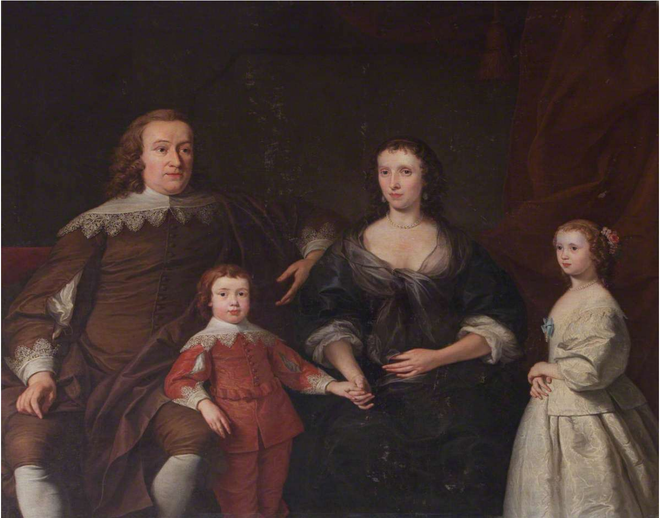
The Countess of Huntingdon, with her family, painted by Andrea Soldi (1703-1770), reproduced with the permission of the Trustees of the Cheshunt Foundation